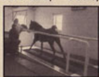
High Speed Treadmills for Training, Research, and Re-hab.

These professional treadmills are fast and stable to train for speed and co-ordination plus they will elevate to 10 degrees for hill climbing and strength training. Enables specific conditioning of either Aerobic and Anaerobic systems. Accurate data collection and displays for Heart Rates, Speed, Distance, and Slope.