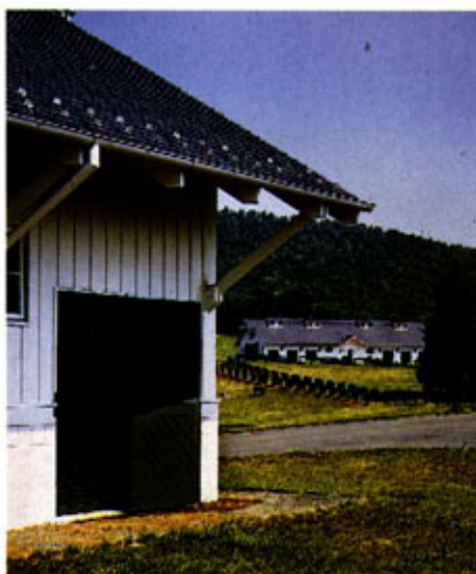
Photo 1. Looking beyond the 13-stall broodmare barn to the identical 20-stall barn. Board and batten siding was back-primed before installation.

The barns are positioned near the crest of a ridge and perpendicular to prevailing summer breezes to force wind into the barn for natural ventilation. Air entering through exterior Dutch stall doors is pulled up and out of the buildings through ridge vents running between