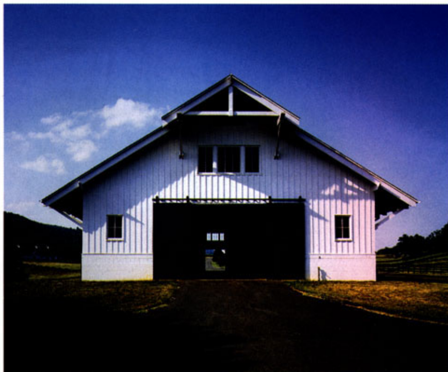
▲ Photo 2. Timber framing, gabled roof and deep overhangs give a fresh elegance to the familiar barn.

Area: Foaling Barn: 6,130sf, Broodmare Barn [13 stall]: 6,100sf., Broodmare Barn [20 stall]: 9,632sf.