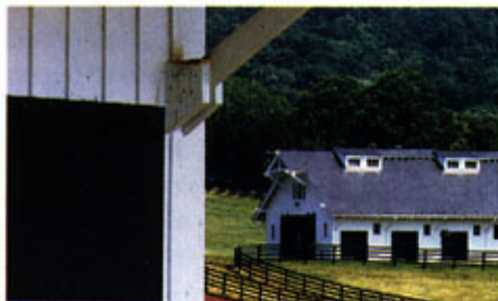
Morven Foaling and Broodmare Barns

Farmers today frequently turn to quick-and-easy, prefabricated industrial kits using pole or steel framing. Still, architects designing barns continue to explore the aesthetic and practical qualities of heavy timber construction. Two recent examples demonstrate variations on this classic theme.