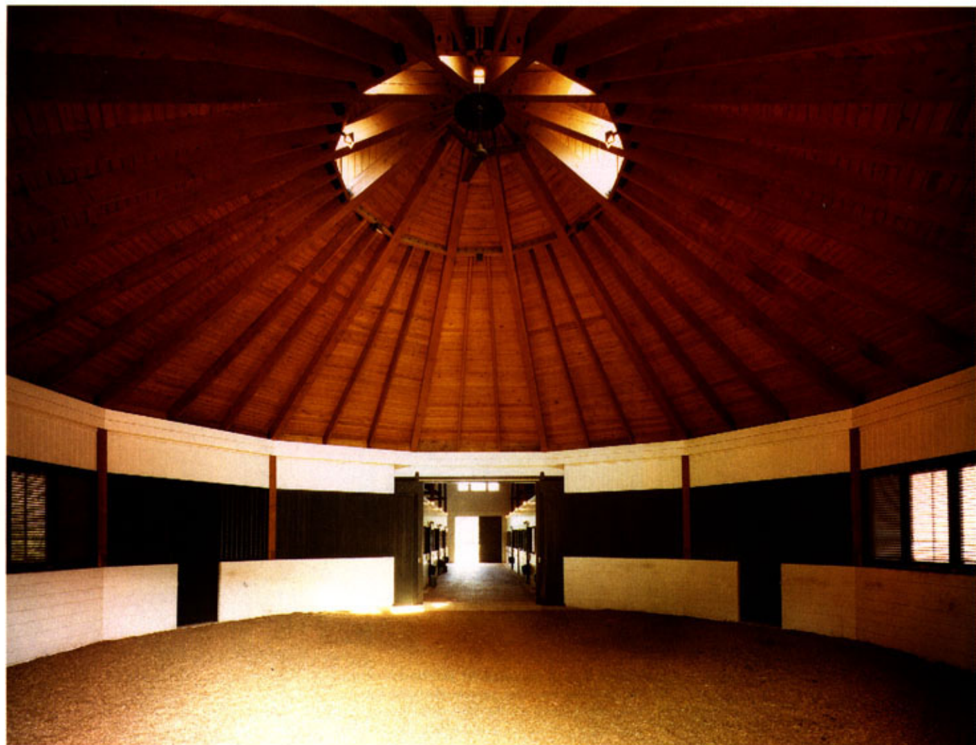
Photo 4. The exercise ring in the foaling barn where the main 6x14 timber rafters converge to a steel compression ring. See Fig. 1.

“Heavy timber wood frame construction makes for a beautiful interior of a barn, it insulates well, and in our opinion makes a safer structure because it will stand in a fire longer than a steel structure,” says the architect. “When clients ask us to frame a barn in steel, we try to convince them otherwise.”