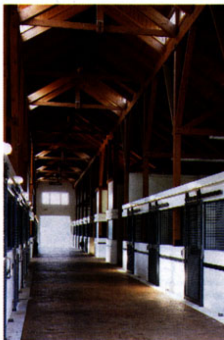
▼ Photo 3. 8x8 Douglas fir posts support an 8x12 beam. The two beam-column assemblies run in parallel lines along the forward edge of each line of stalls, supporting the roof rafters and decking.