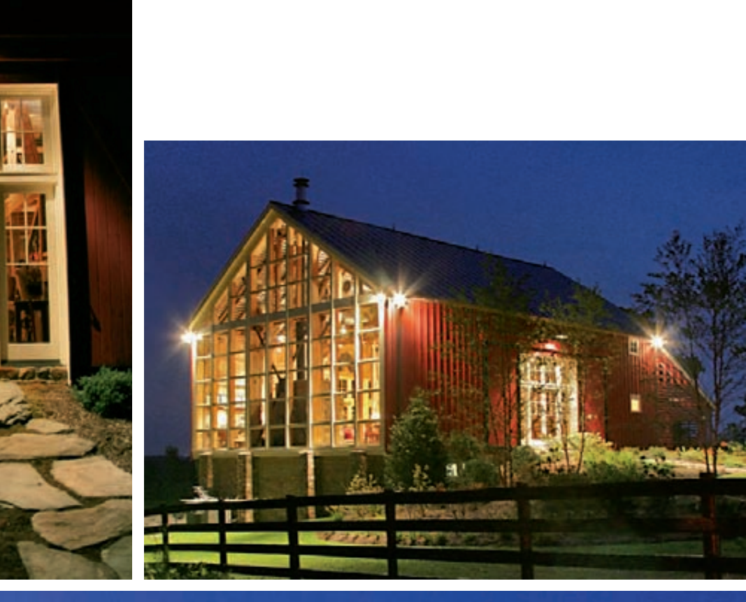
As Seen in the Early Winter 2006 Issue of Washington Spaces