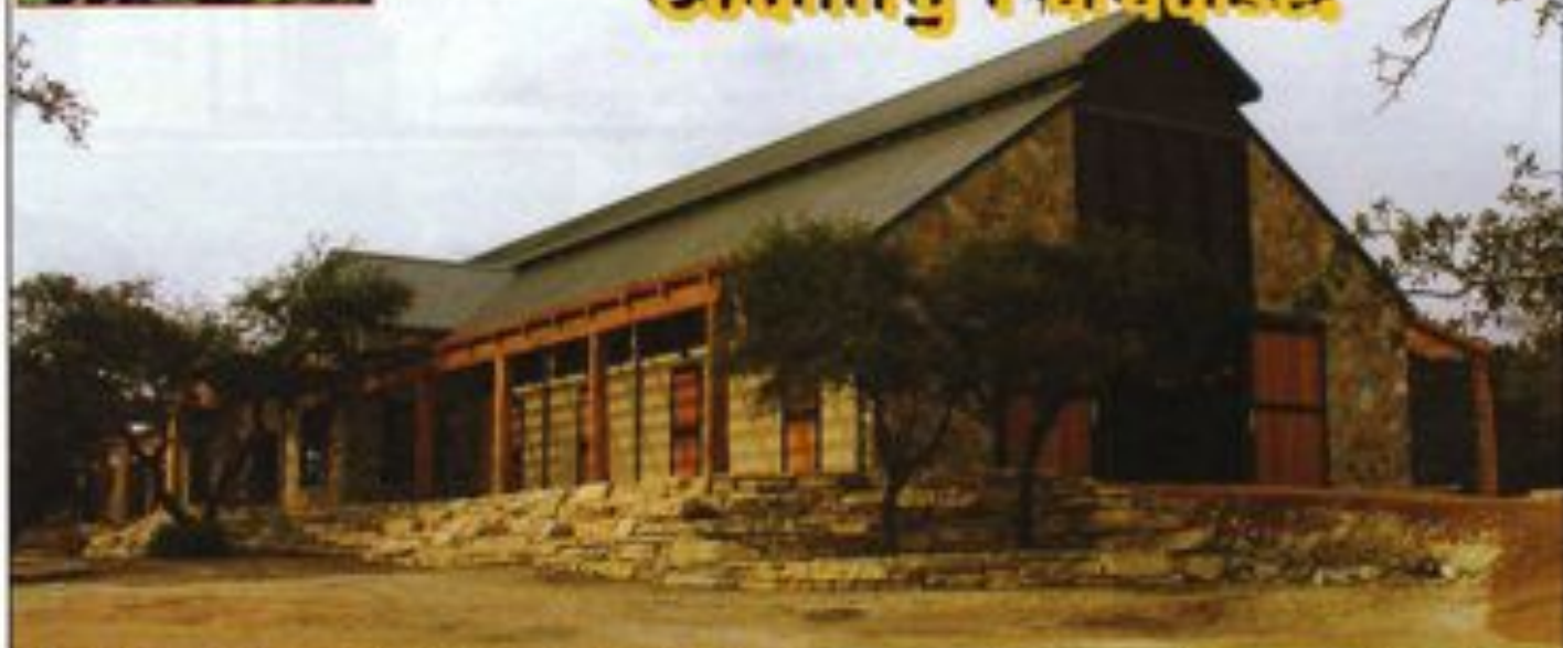
This 16-stall horse barn with office, tack and lounge coexists along with a round pen, staff residence, run in shed, hay barn and storage facility.