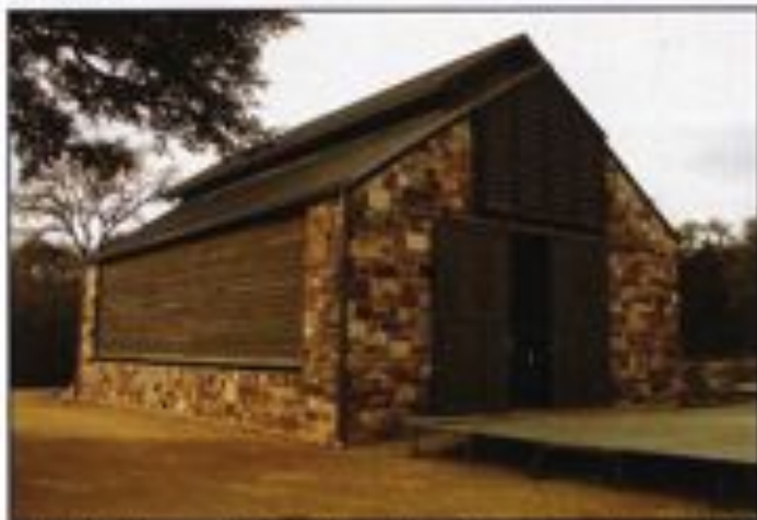
Hay is for horses, and this hay barn keeps it fire safe and convenient to retrieve by staff. Roll up aides allow ventilation and ease of accessibility.