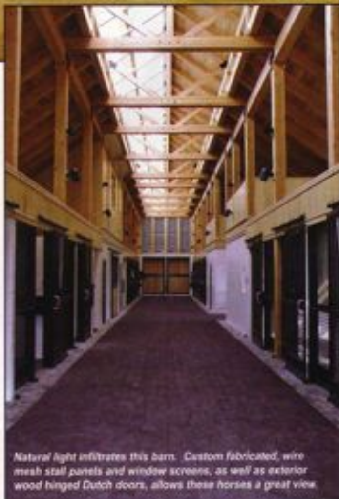
Natural light infiltrates this barn. Custom fabricated, wire mesh stall panels and window screens, as well as exterior wood hinged Dutch doors, allows these horses a great view.