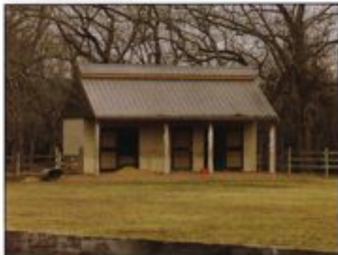
Cedar siding and trim is on this two-stall run-in shed barn brings a sense of uniformity to all farm structures. This shed has storage for feed and hay out in the paddock.