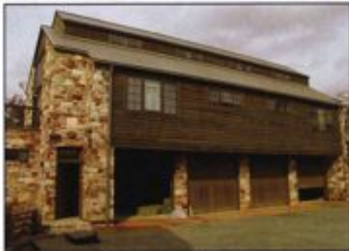
The service storage building hides unsightly tractors and other farm vehicles and helps to create a courtyard feel as it is situated adjacent to the horse barn and hay barn.