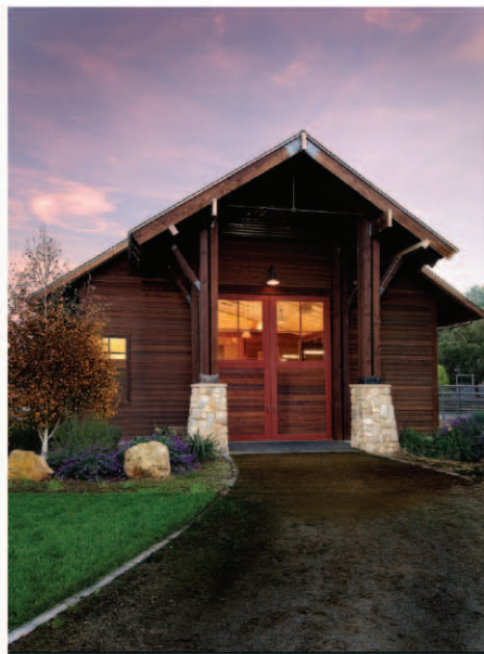
Northern view showcases the 16' barn doors.

The house will include an outdoor BBQ area for the family to relax in after a long, sunny day of riding. Inside, a 34-foot exposed stone chimney will keep the clan cozy on cool winter nights.