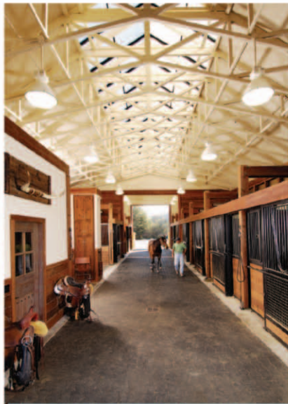
The skylight illuminates the barn aisle's rubber "brick" pavers.

Gus enjoys an afternoon snack in the cool and breezy "lunchroom."