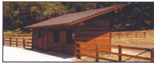
The run-in shed is built into the paddock and offers the ability to fill the hayrack from outside.