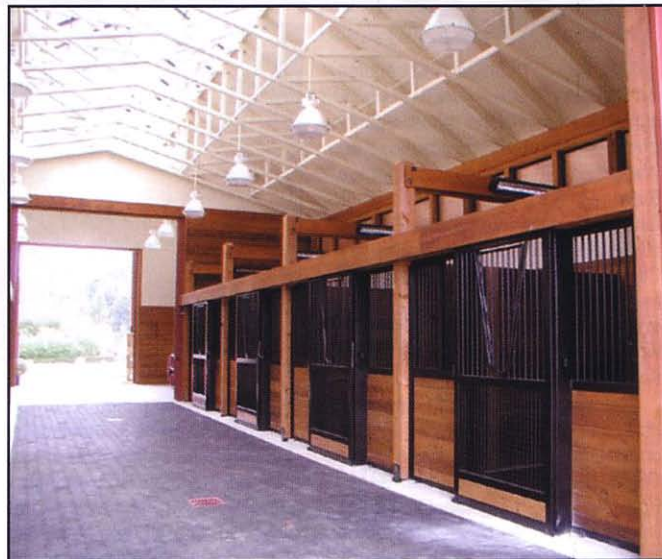
Redwood timber framing supports black powder-coated sliding stall front doors.

The Devine Ranch barn is built of redwood timber framing with hammered metal connections and Montana River rock column piers.