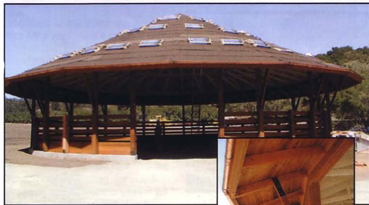
The 60' diameter round pen awaits finishing touches; details include deep overhangs of beautiful cedar decking and elegant copper gutters supported by redwood timber outriggers.