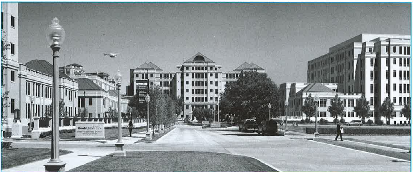
Cook Children's Medical Center expansion in Fort Worth, TX.