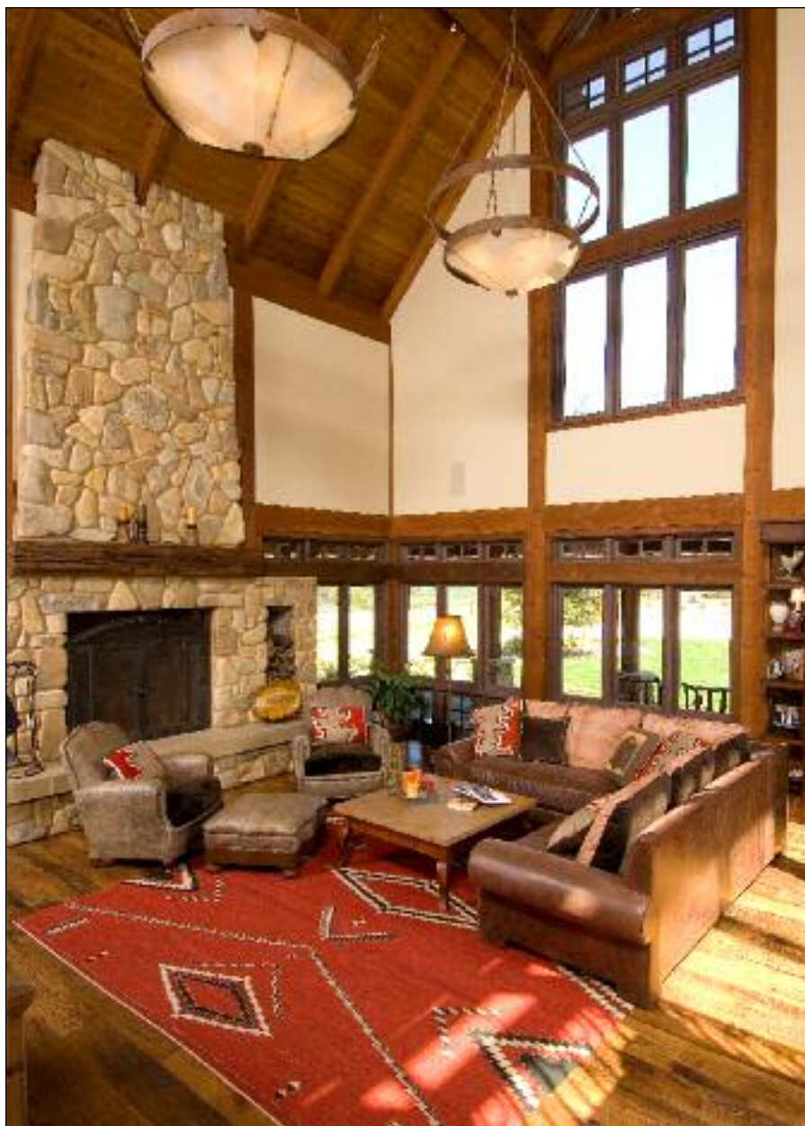
Devine Residence (Custom Residential) — Photo: Paul Schraub