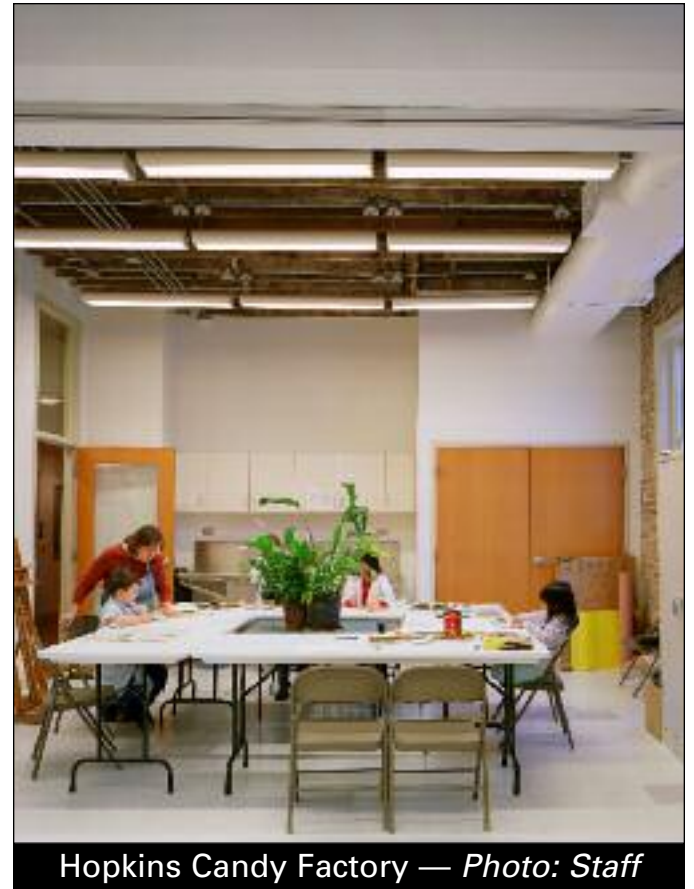
Hopkins Candy Factory