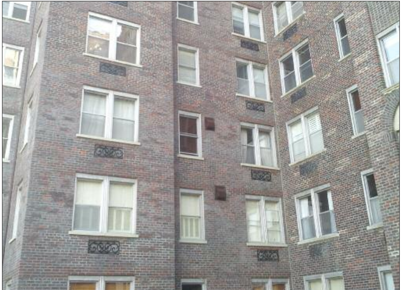
Westchester (Historic Restoration/Facade Restoration)