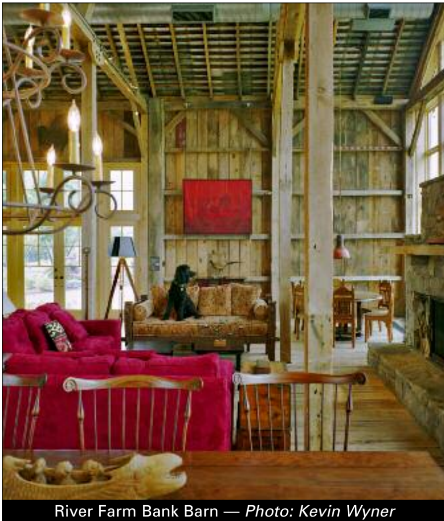
River Farm Bank Barn