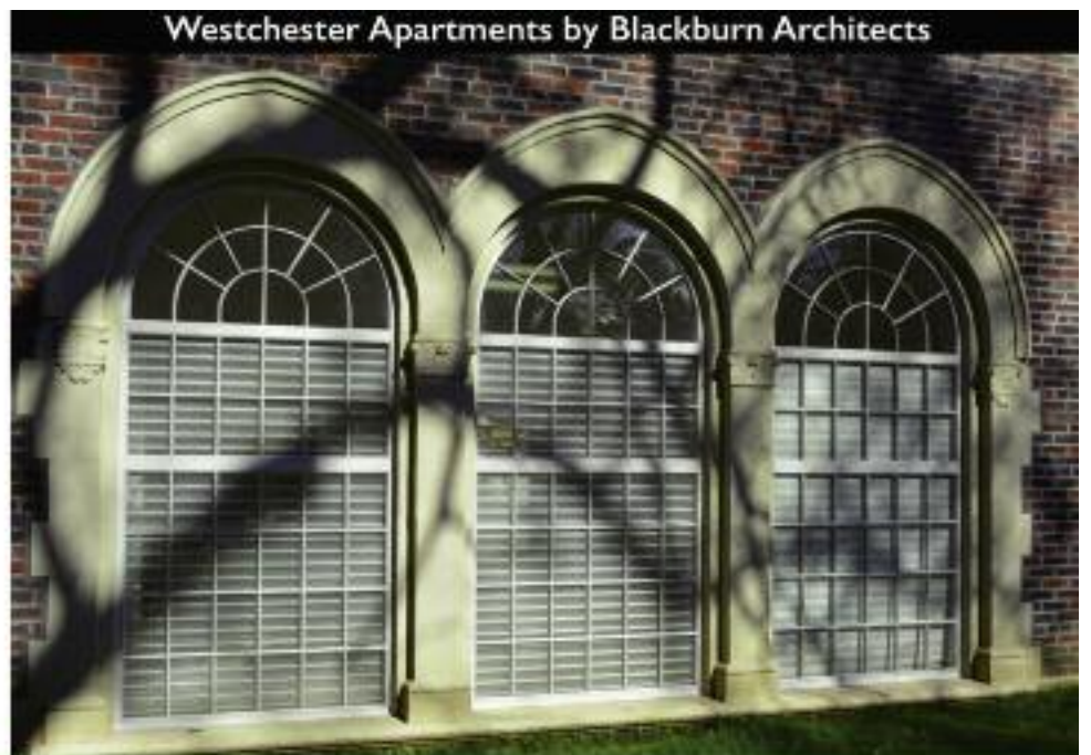
Westchester Apartments by Blackburn Architects

arcadia CUSTOM DOOR AND WINDOW SOLUTIONS STEEL - ALUMINUM - WOOD