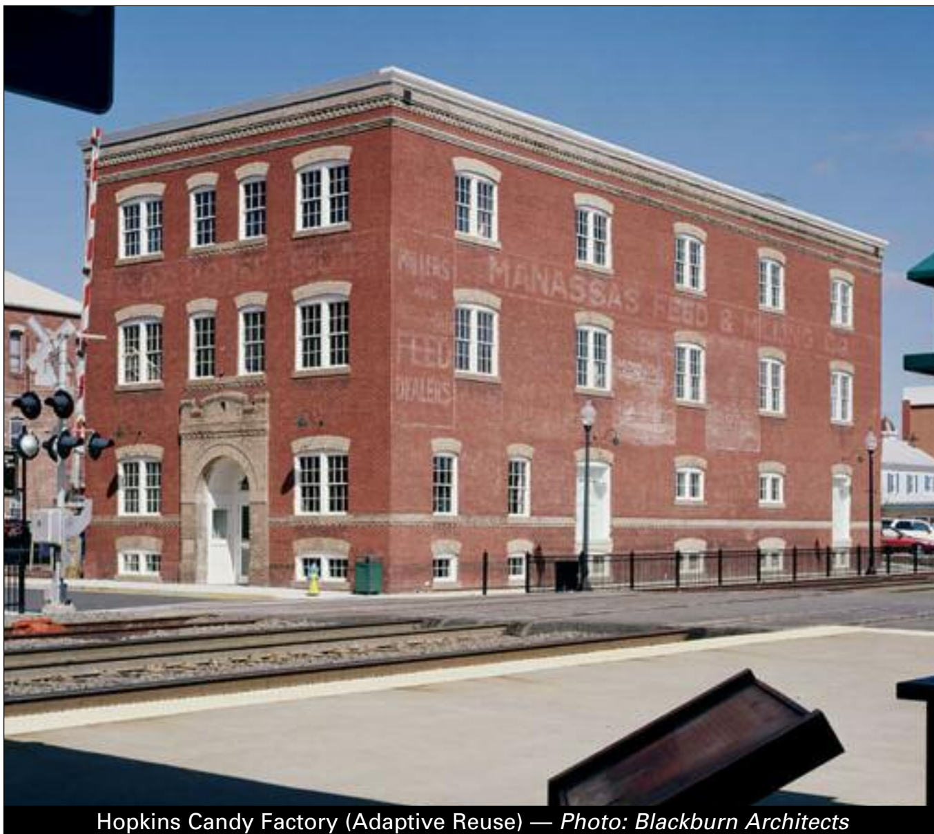
Hopkins Candy Factory (Adaptive Reuse) — Photo: Blackburn Architects