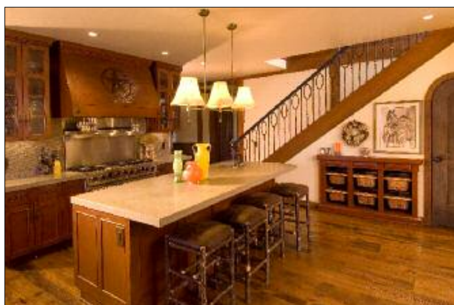
Devine Residence (Custom Residential)