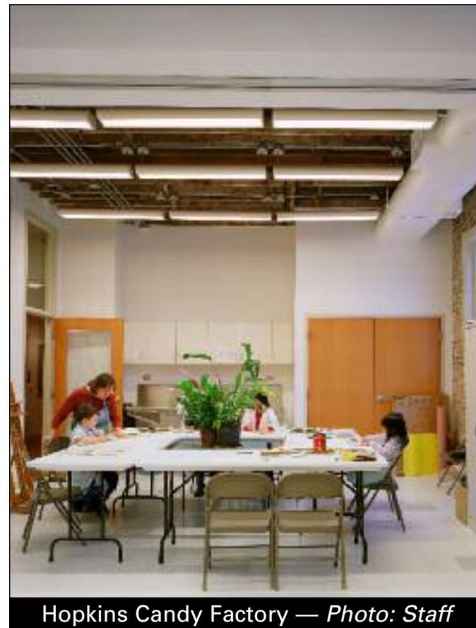
Hopkins Candy Factory