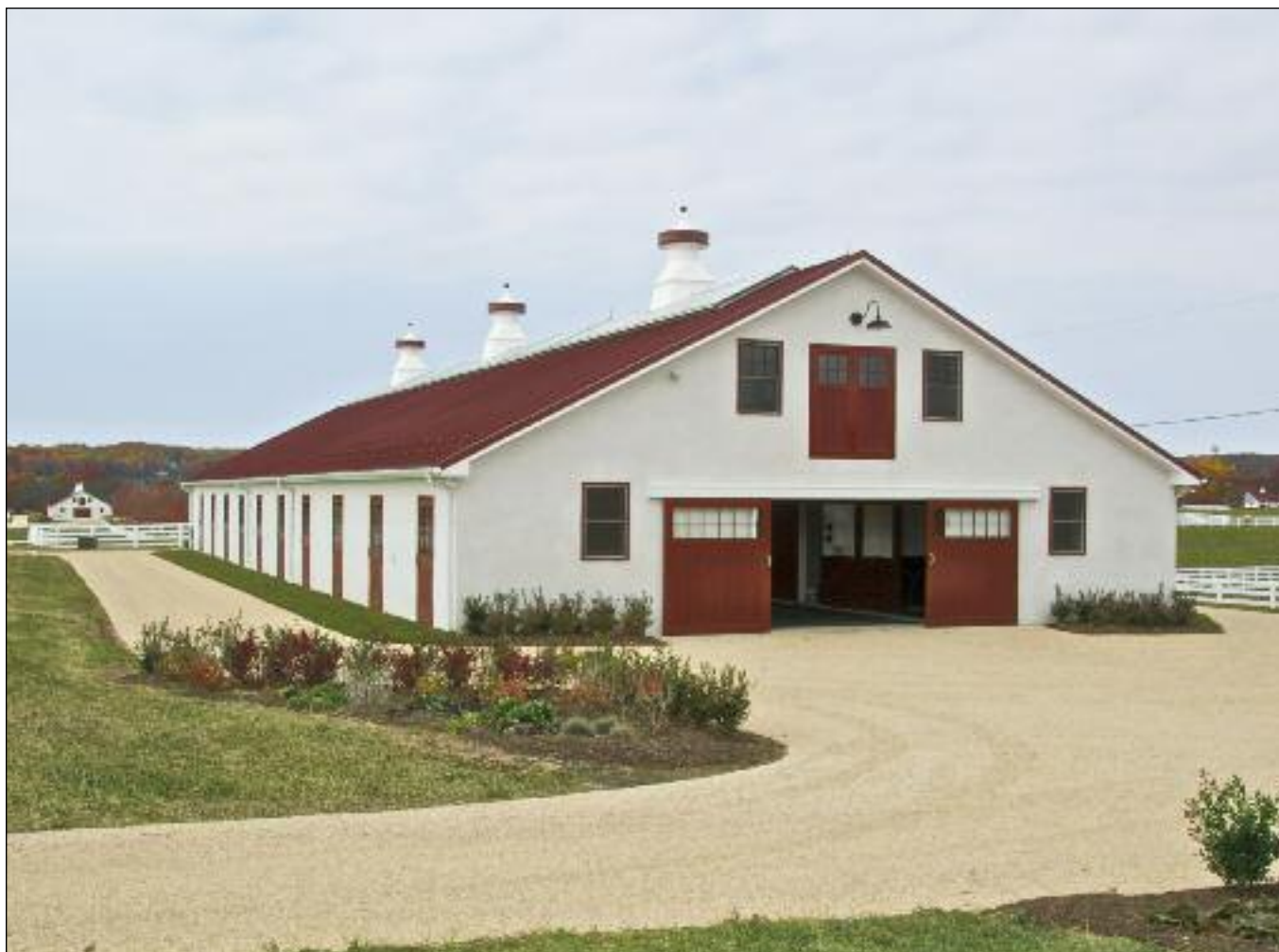
Sagamore (Renovation; Equestrian) — Photo: Cesar Lujan