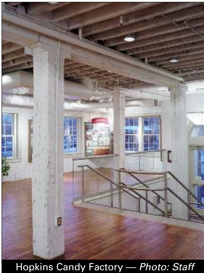
Hopkins Candy Factory