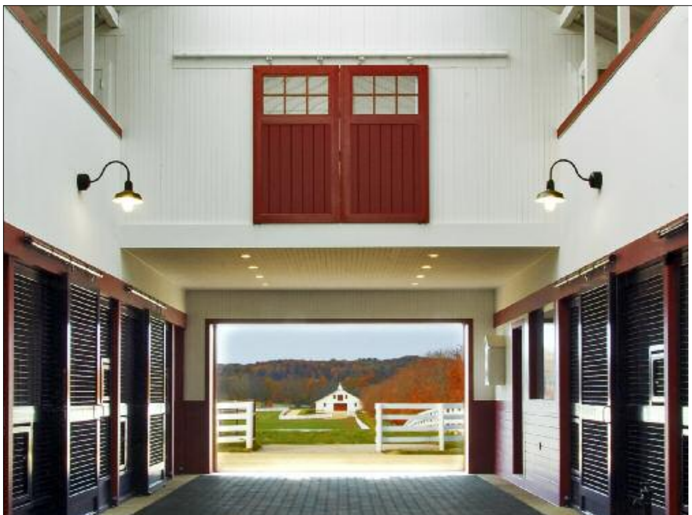
Sagamore (Renovation; Equestrian)