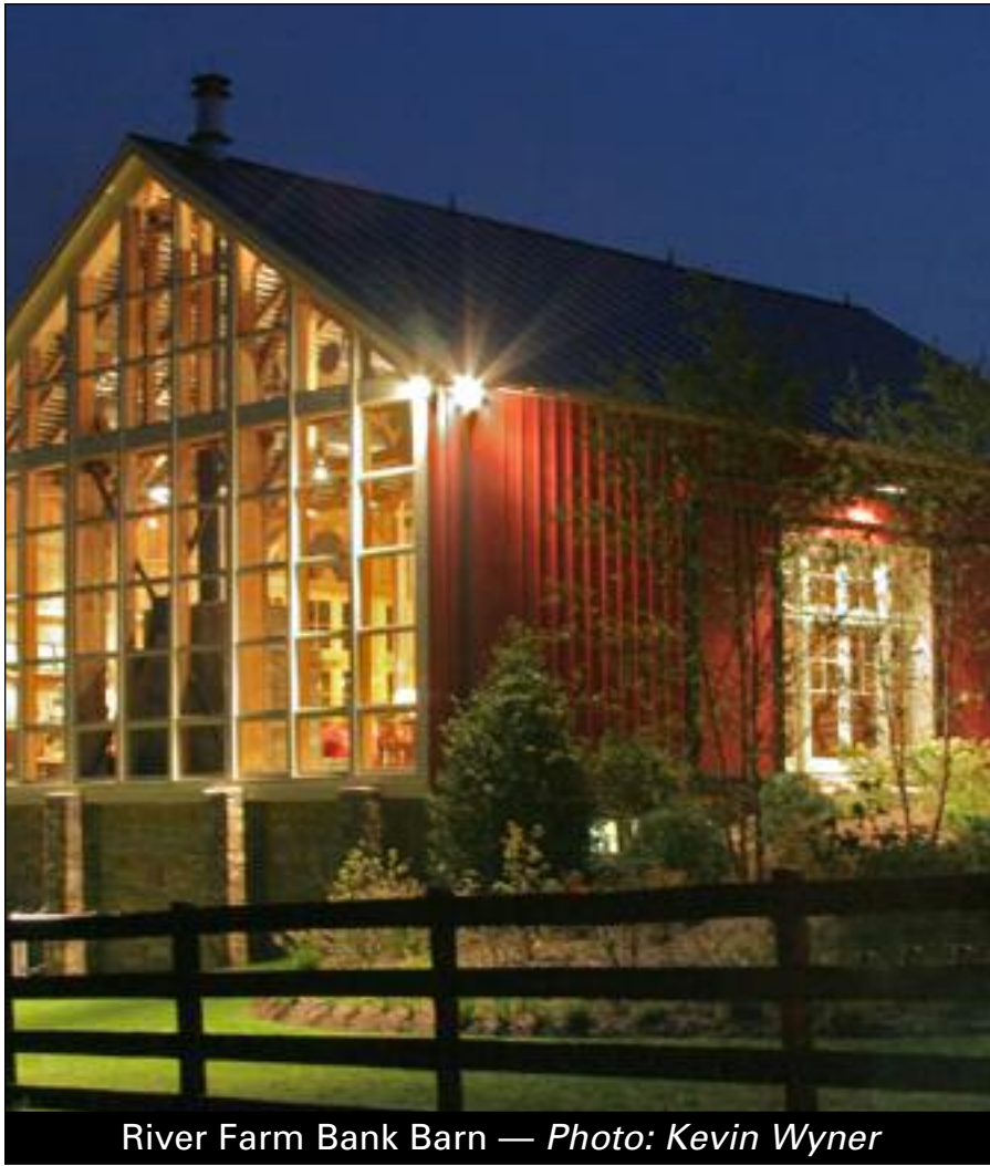
River Farm Bank Barn