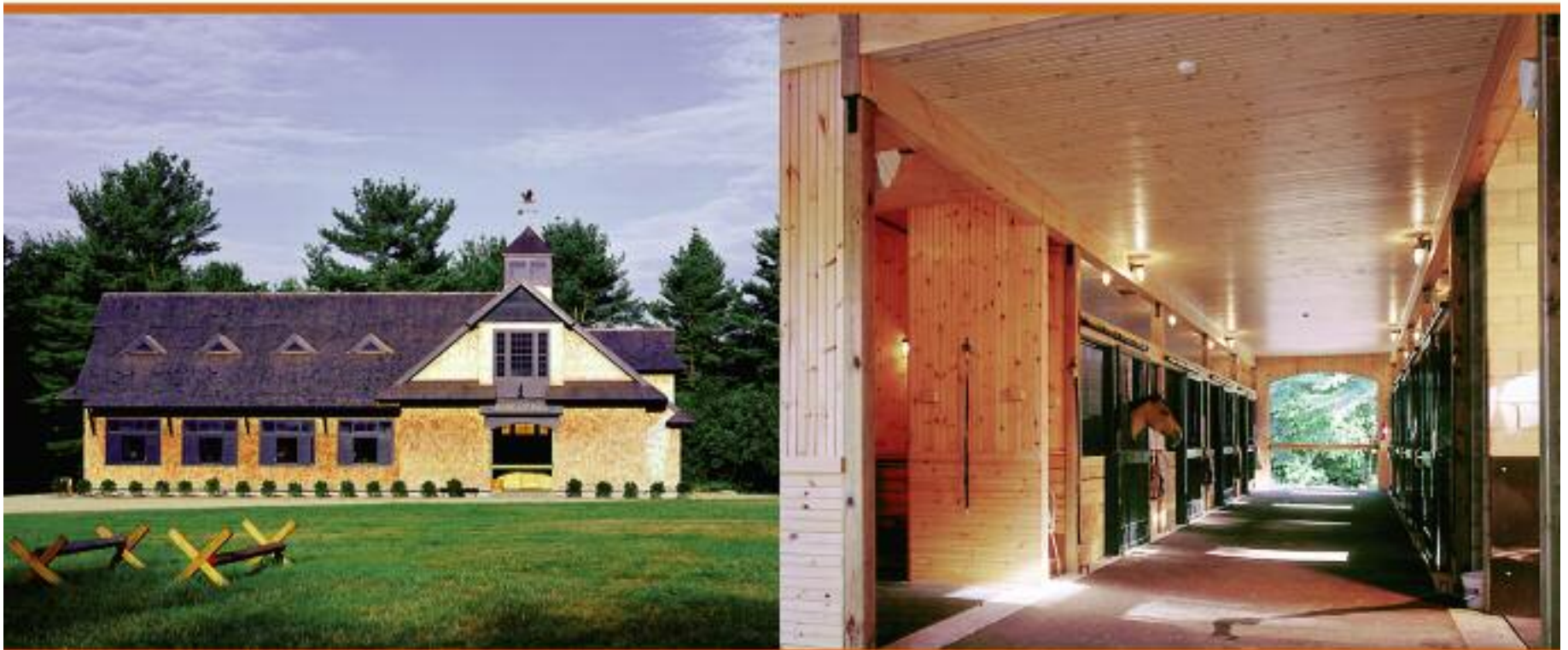
Round Lot Farm - Medfield, Massachusetts

Over Three Decades of Experience in Design Excellence