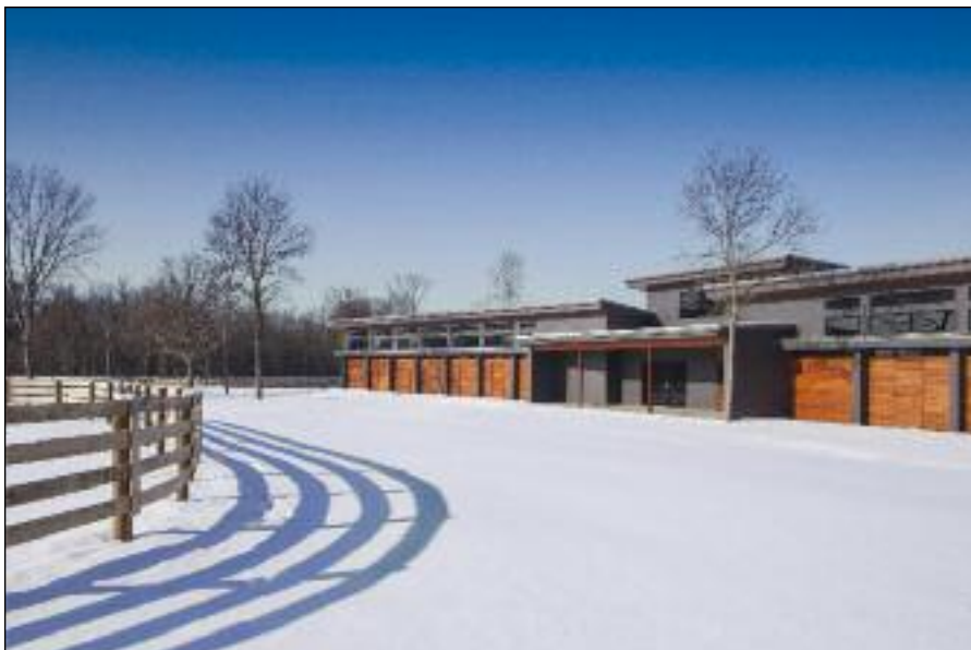
Pegaso (Equestrian)