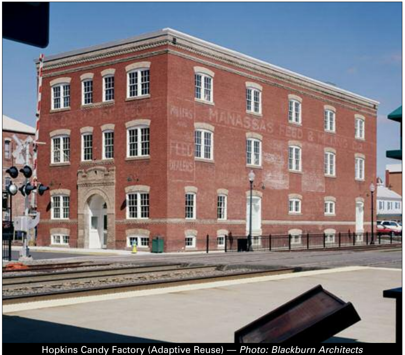
Hopkins Candy Factory (Adaptive Reuse)