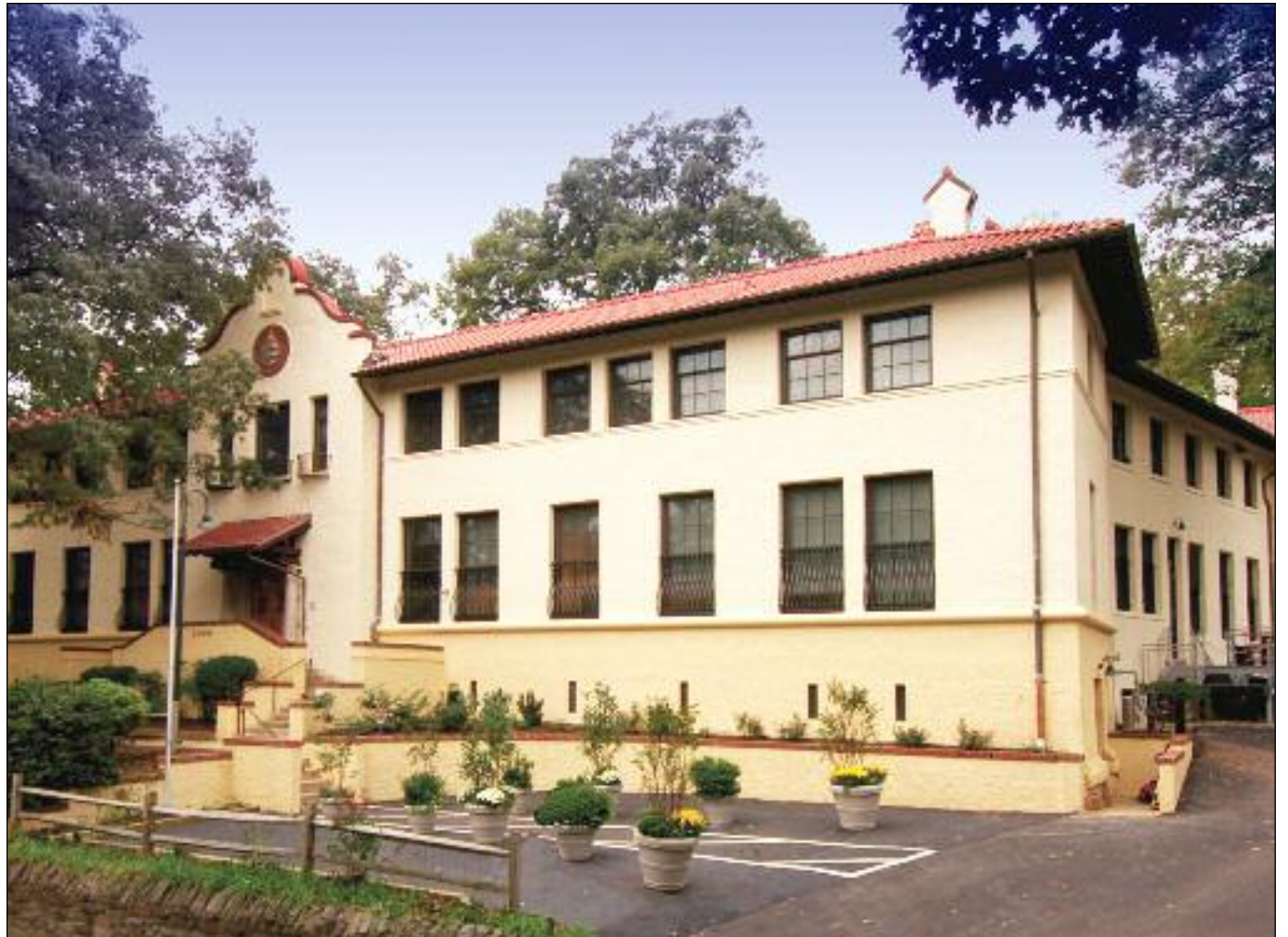
Rosemount (Adaptive Reuse) — Photo: Blackburn Architects