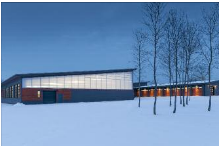
Pegaso (Equestrian)