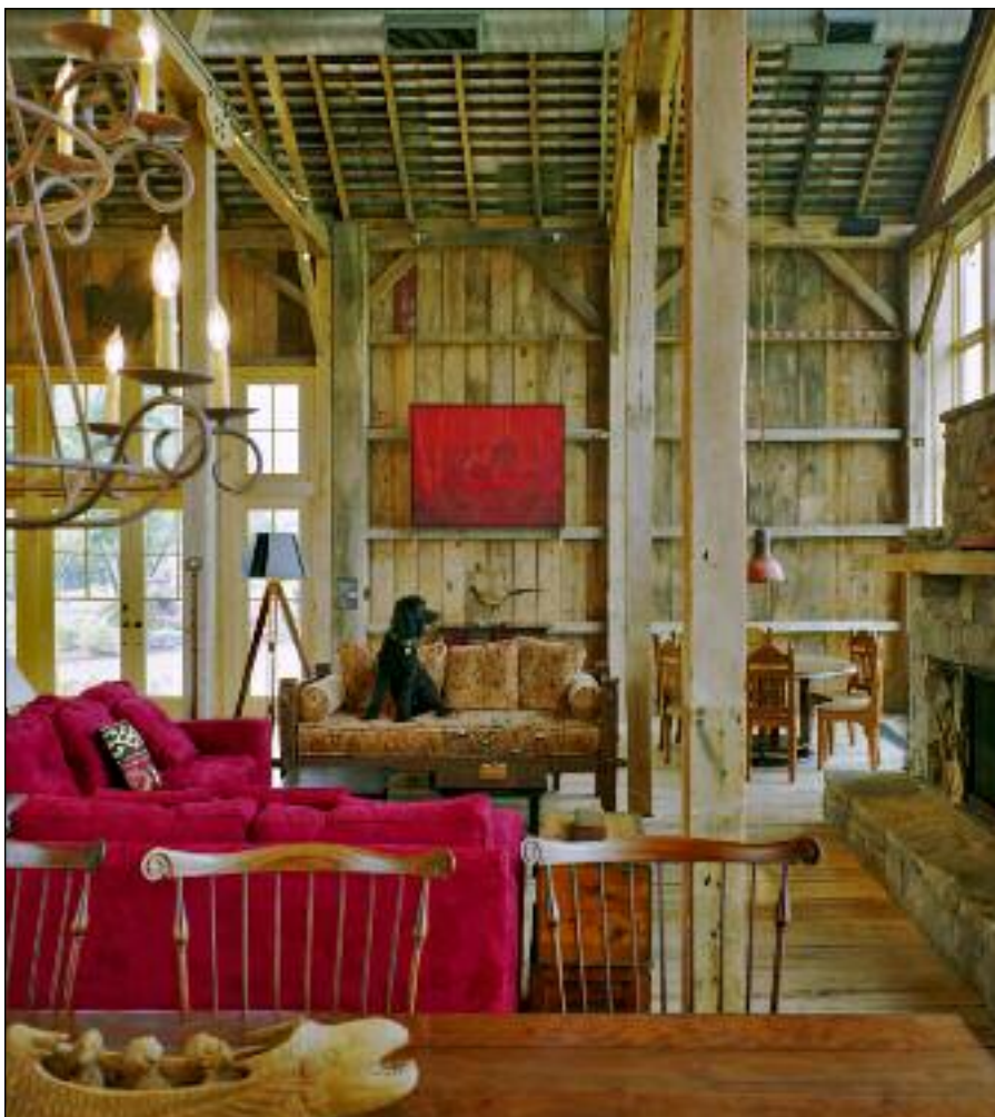
River Farm Bank Barn