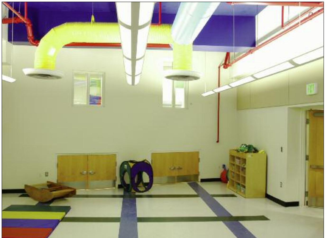
Rosemount (Adaptive Reuse)