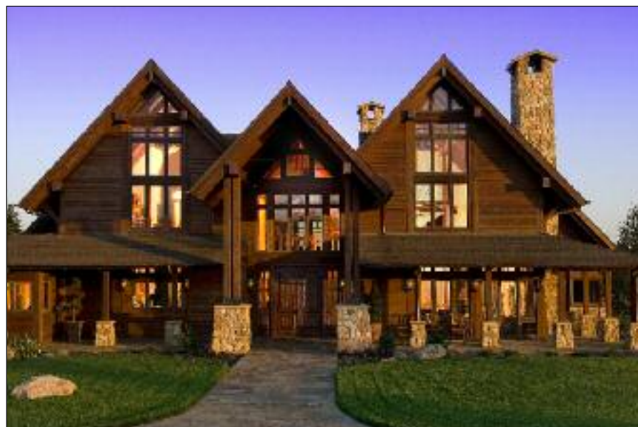
Devine Residence (Custom Residential)